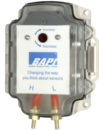
Differential Pressure Switch

The unit also features an extremely high proof pressure of 100" W.C. so that it will continue to function properly even if it is accidentally connected to an unusually high or low pressure.