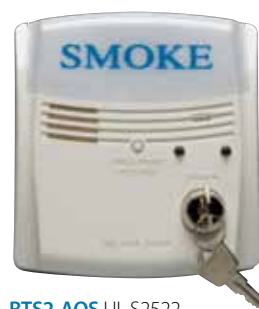
RTS2-AOS UL S2522